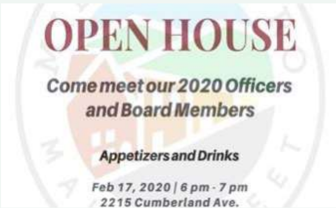
Middlesboro Main Street

Take a moment and visit one of the tri-cities Main Street communities, Lynch at their new website: visitlynch.org