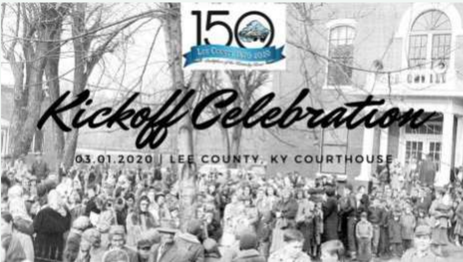
Downtown Beattyville Sunday, March 1, 2020 at 3 PM – 5 PM

Take a moment and visit one of the tri-cities Main Street communities, Lynch at their new website: visitlynch.org